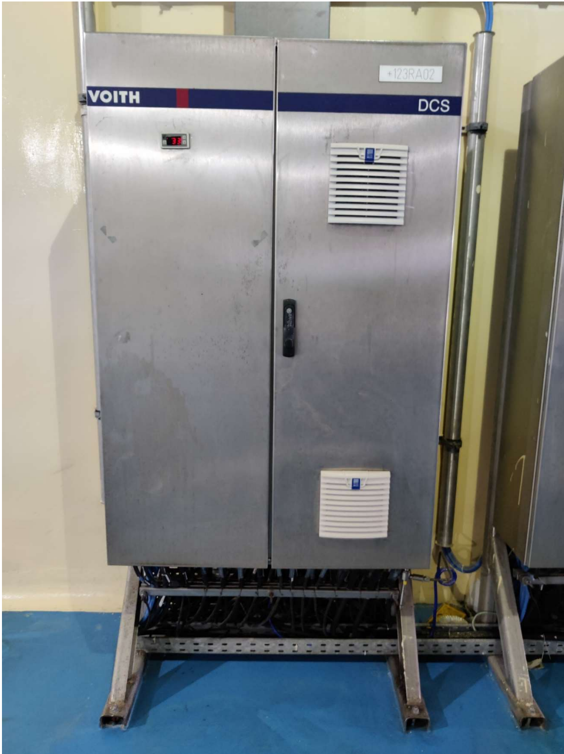
Existing Panel External View: